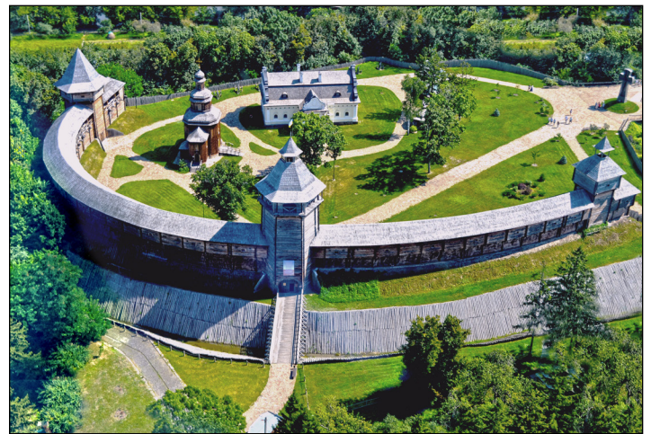
Fig. 2 (below). Fortifications, the Resurrection Church, the earliest hetman residence, and the treasury in the 17th-century Baturyn citadel, reconstructed on the basis of archaeological data in 2008. Aerial photo by N. Rebrova.

hypothetical general view, plan, and defensive structures of 17th-century Baturyn.