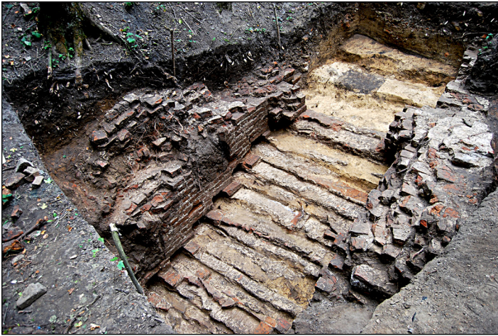
Fig. 4. Remnants of brick side walls and steps of the underground tunnel, excavated at Mazepa's manor (ca. 1700) in Honcharivka, the suburb of Baturyn, in 2019.

Judge General Vasyl Kochubei in Baturyn and the chancellor of the local Cossack regiment in Chernihiv of the late 17th century.