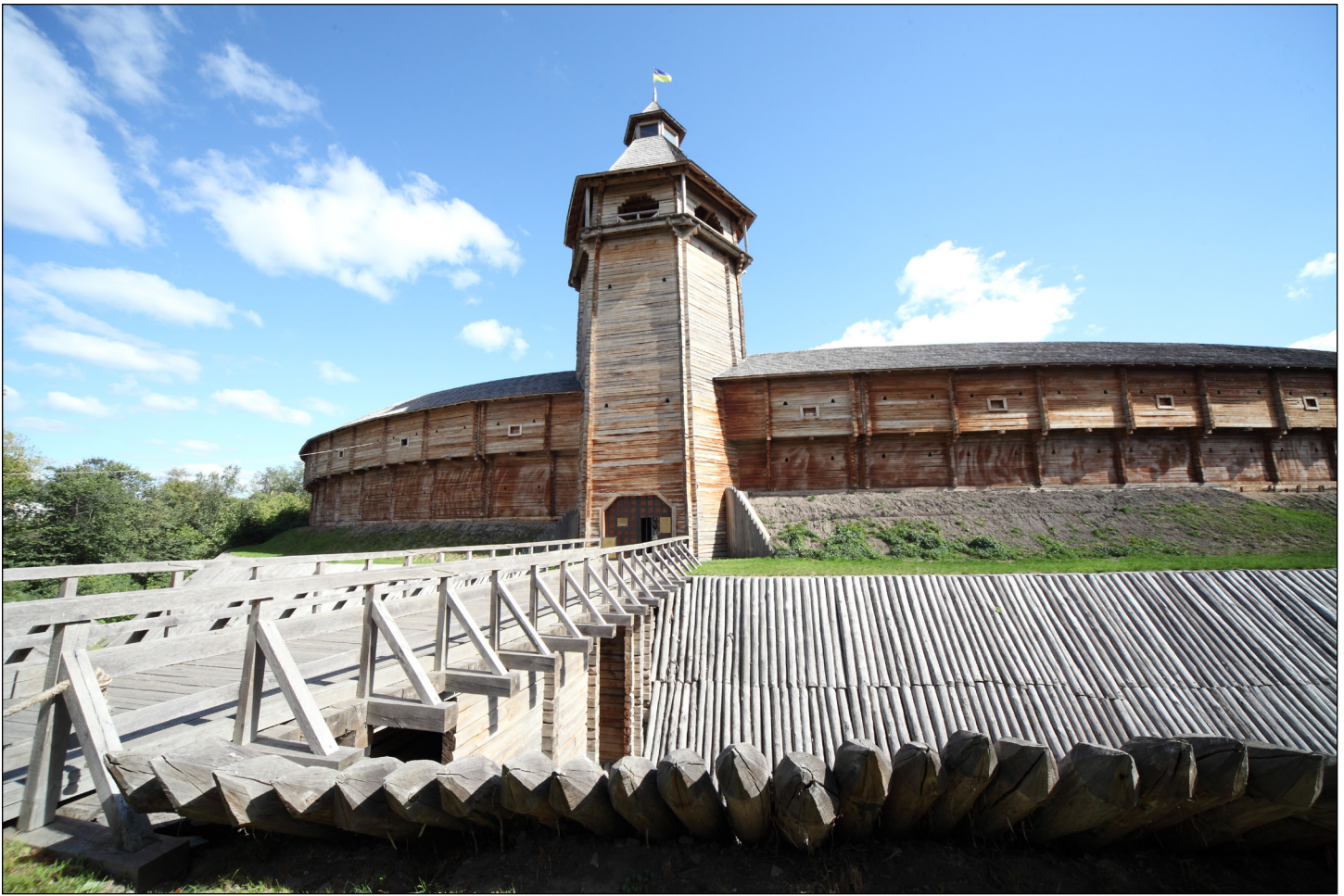
Fig. 3. Citadel's moat with a bridge, rampart, log wall, and tower gate.

ment during the illustrious reign of Hetman Ivan Mazepa (1687-1709). But in 1708, this Cossack ruler resisted militarily the increasing absolutist power of Muscovy over central Ukraine. That year, the Russian army totally destroyed Baturyn, the main military base of Mazepa's revolt. The dynamic Hetman Kyrylo Rozumovsky (1750-64) rebuilt the town, restored its status as the capital of the fading Cossack realm, and promoted its demographic, economic, and cultural revival until his death in 1803. During the 19th and 20th centuries, Baturyn declined into an insignificant rural settlement.