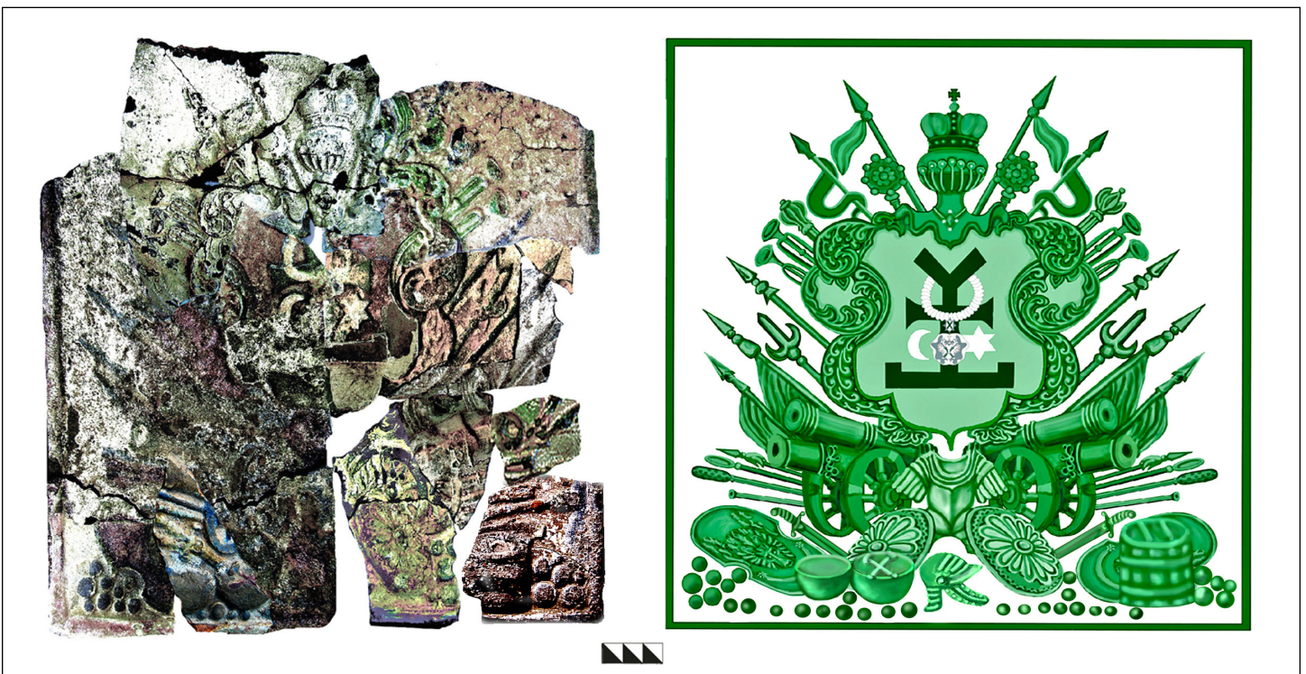
Fig. 5. Burnt glazed ceramic relief stove tile featuring Mazepa's coat of arms, 1707-08. Hypothetical reconstructions, computer photo collage and graphic by S. Dmytriienko, 2019.

Around the shield are relief images of symmetrically placed