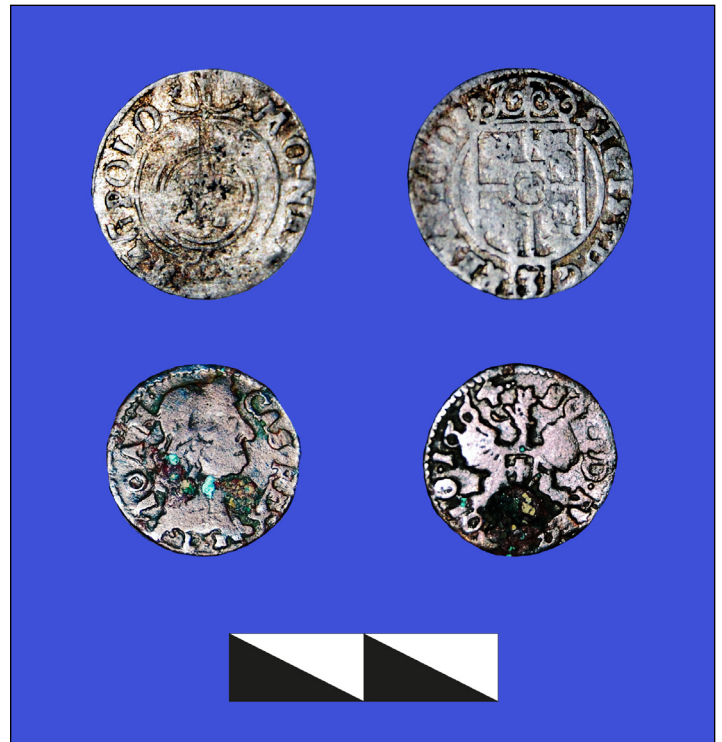
Fig. 5 (below). Obverse and reverse of 17th-century Polish coins (silver on top, copper on bottom). 2018 excavations at Baturyn.

Similar ceramic tiles adorned the heating stoves and fireplaces of two Rozumovsky palaces (1752 and 1799) in Baturyn. They could have been imported by this hetman from Holland or represent less expensive 18th-century Russian or Ukrainian imitations of the fashionable and prestigious Dutch revetment majolica of the time.