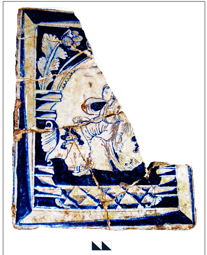
Fig. 4a (left), 4b (above). Fragments of glazed ceramic stove tiles featuring human figures in Dutch style, mid-18th century.